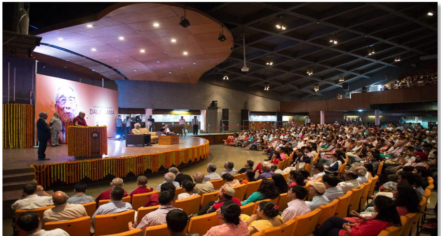
His Holiness the Dalai Lama speaking at the Indian Institute of Technology (IIT) in New Delhi, India on April 9, 2016

His Holiness the Dalai Lama at the American Embassy School, 08 April 2016