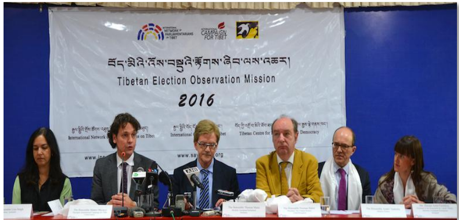
Eminent members of The International Network of Parliamentarians on Tibet (INPAT) during the press conference on 21 March 2016 at Dharamshala, India on 21 March 2016.

Press Statement of The International Network of Parliamentarians on Tibet (INPAT) 21 March 2016