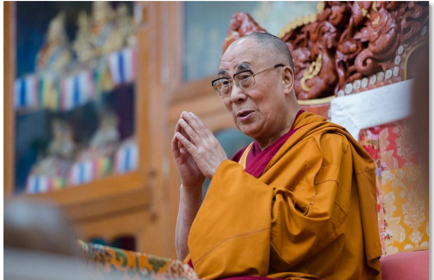
His Holiness the Dalai Lama joining in recitations at the start of his teachings at Gyumey Tantric College in Hunsur, Karnataka, India on December 9, 2015.

His Holiness the Dalai Lama, 10 December 2015